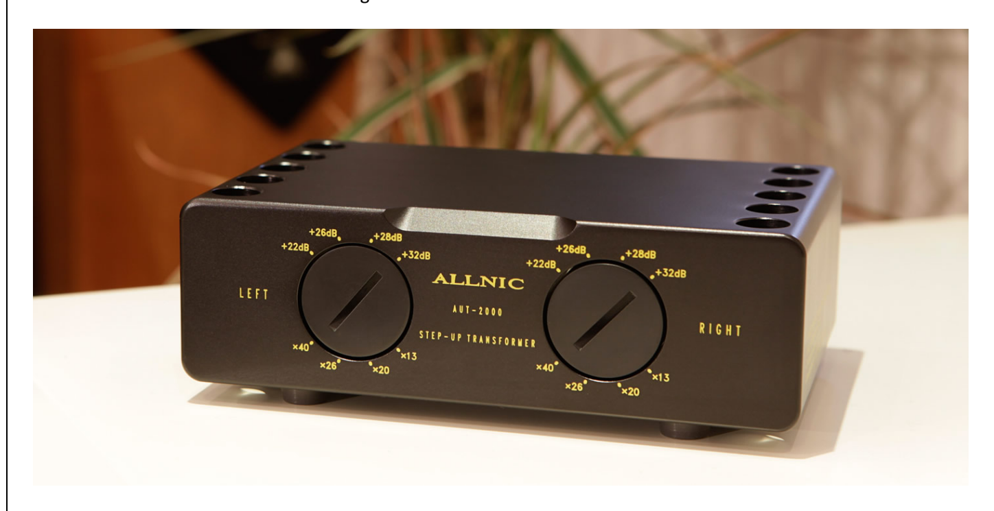
Figure 5 - AUT 2000 Front Panel View