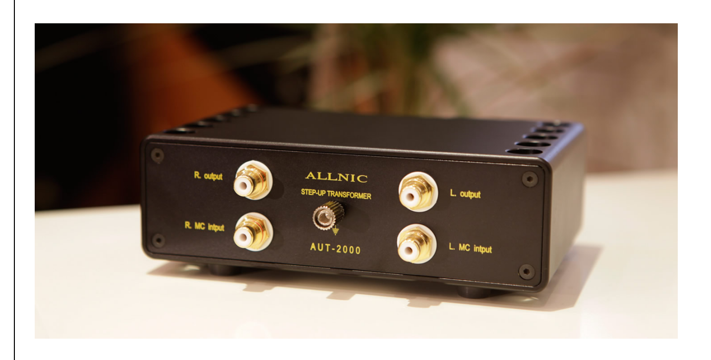
Figure 4 – AUT 2000 Rear Panel View

Allnic's Zero Loss Technology MU metal shielded interconnects will work most synergistically with the AUT 2000.